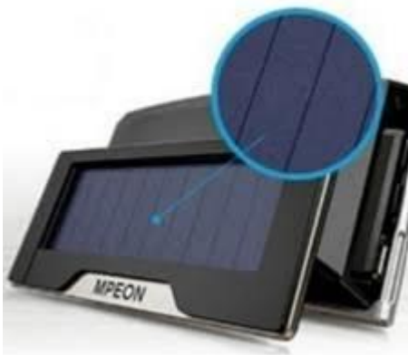
Sample image 1

When the plastic case covers the edges of the solar module, care must be taken not to cover the active silicone area of the solar module. Covering will reduce the solar module efficiency. However, be aware that most high-efficiency solar modules have limited edge space to maximize the power density of the solar module. In some cases, 3M tape can be used to attach the product to the windshield surface.